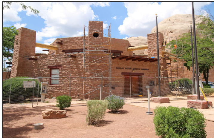
Photo: Temporary stubs are being installed to prevent moisture from entering the space within the columns, which preserves the space for the permanent logs.

The construction team successfully completed Phase I and Phase II. Phase I involved the design and planning, while Phase II focused on the interior renovation from the remodeling of the council floor, gallery, and staff gallery to the replacement of windows in the high wall area. The remodeling of the interior was initiated to comply with the Americans with Disability Act accessibility guidelines for public buildings.