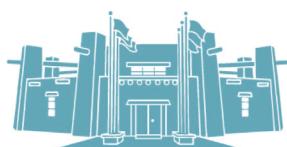
LoRenzo Bates, Speaker 23 rd Navajo Nation Council