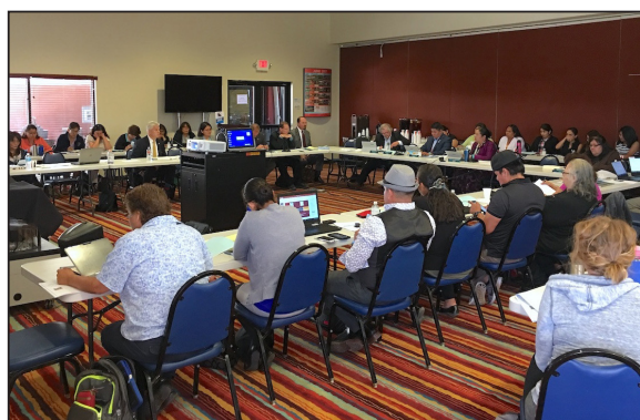
Photo: SAPS/HEHSC members discussing tribal and federal processes regarding sexual assault on the Navajo Nation, in which over 60 participants from various sexual assault programs, federal programs, law enforcement, and health/assault prevention advocacy programs participated in the discussion on June 15, 2017 at Fire Rock Casino in Churchrock, N.M.

Federal officials presented vital information regarding their role in sexual assault cases and answered questions from the committees to aid in their understanding of the