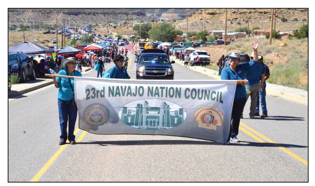
PHOTO (above): The 23^{rd} Navajo Nation Council during the Eastern Navajo Agency Fair parade in Crownpoint, N.M. on July 22, 2017.