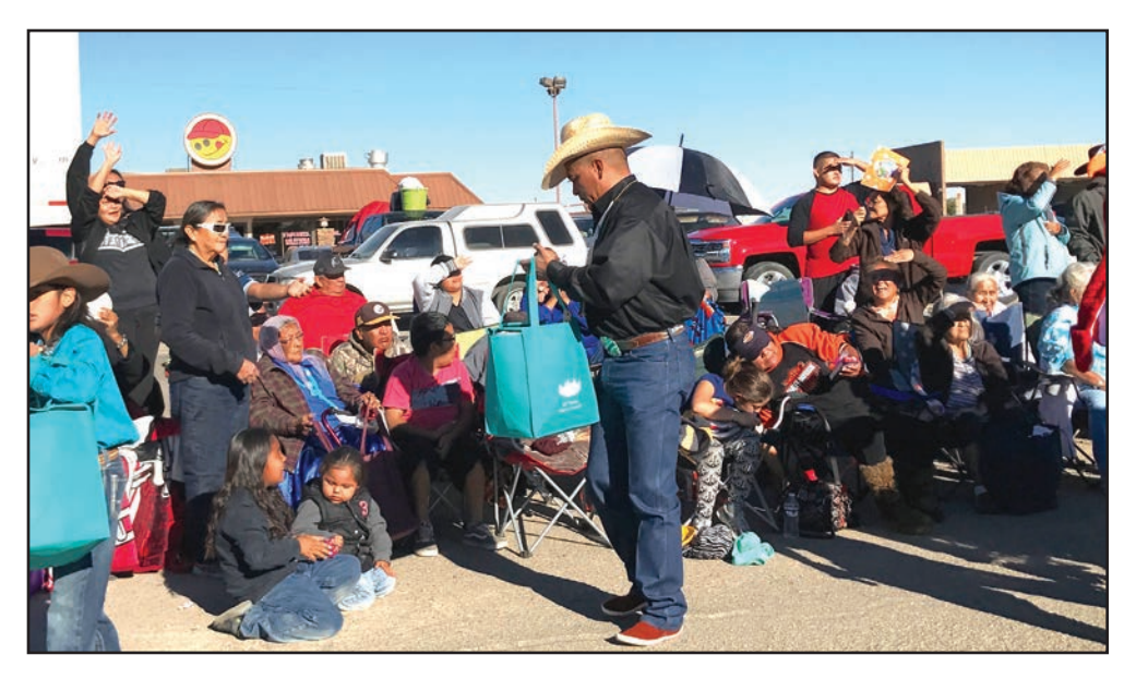
PHOTO (above): Council Delegate Tuchoney Slim, Jr. during the 106th Northern Navajo Nation Fair parade in Shiprock, N.M. on Oct. 7, 2017.