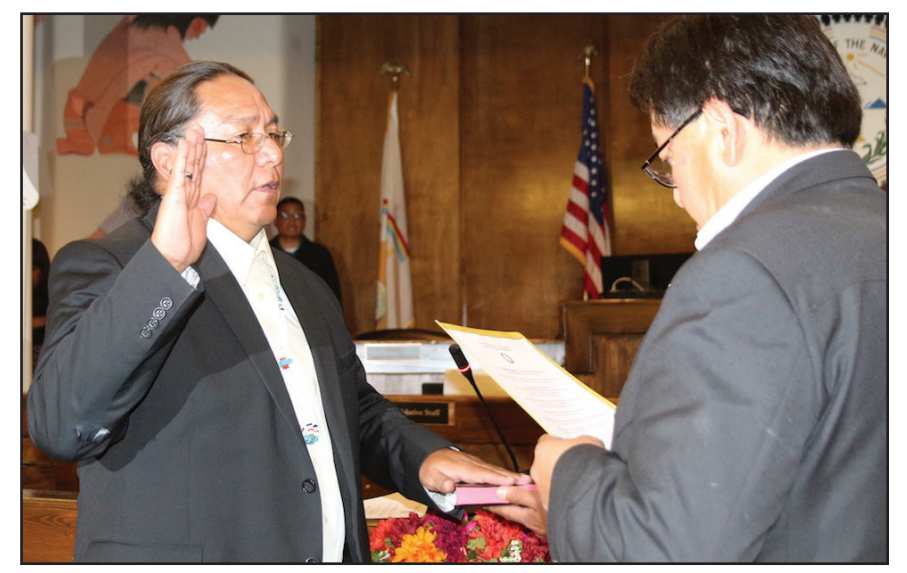
PHOTO (above): Malcolm P. Begay takes the oath of office administered by acting Navajo Nation Chief Justice Thomas J. Holgate after being confirmed as a permanent judge by the Navajo Nation Council, during the 2017 Fall Council Session at the Council Chamber in Window Rock, Ariz. on Oct. 18, 2017.

On April 26, the LOC approved legislation recommending the permanent appoint-