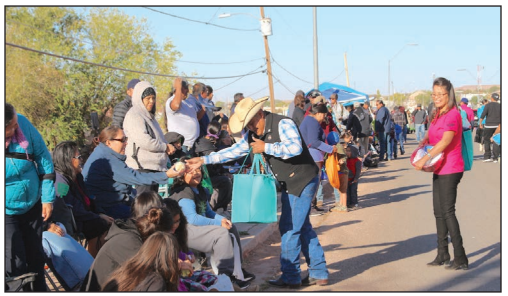
PHOTO (above): Council Delegate Otto Tso along the Western Navajo Agency Fair parade route in Tuba City, Ariz. on Oct. 14, 2017.