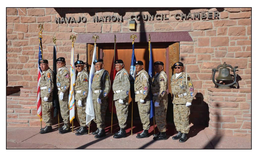
PHOTO (above): Tohatchi Veterans Organization posted the colors during the opening day of the 2017 Fall Council Session at the Council Chamber in Window Rock, Ariz. on Oct. 16, 2017.