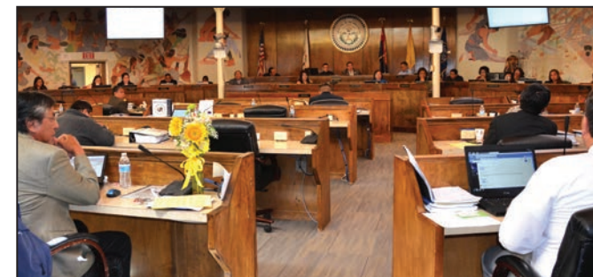
PHOTO (above): Council Delegates discussing Legislation No. 0108-17 during the 2017 Spring Council Session.

Council members voted 18-0 to approve Legislation No. 0108-17, which required two-thirds or 16 supporting votes from the Council. President Russell Begaye will have ten calendar days to consider the resolution once it is sent to the Office of the President and Vice President.