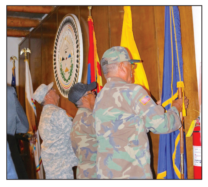
PHOTO (above): Dilcon Veterans Organization posted the colors during the opening day of the 2018 Winter Council Session at the Council Chamber in Window Rock, Ariz. on Jan. 22, 2018.

To view the full report from Speaker Bates, please visit the Navajo Nation Council's website at www.navajonationcouncil.org.