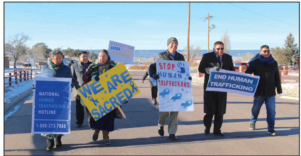
PHOTO (above): Navajo Nation leadership from the Legislative, Executive, and Judicial branches participated in the Navajo Nation "Blue Campaign" Human Trafficking Awareness Walk to the Navajo Nation Council Chamber on Monday, Jan. 22, 2018 in Window Rock, Ariz.