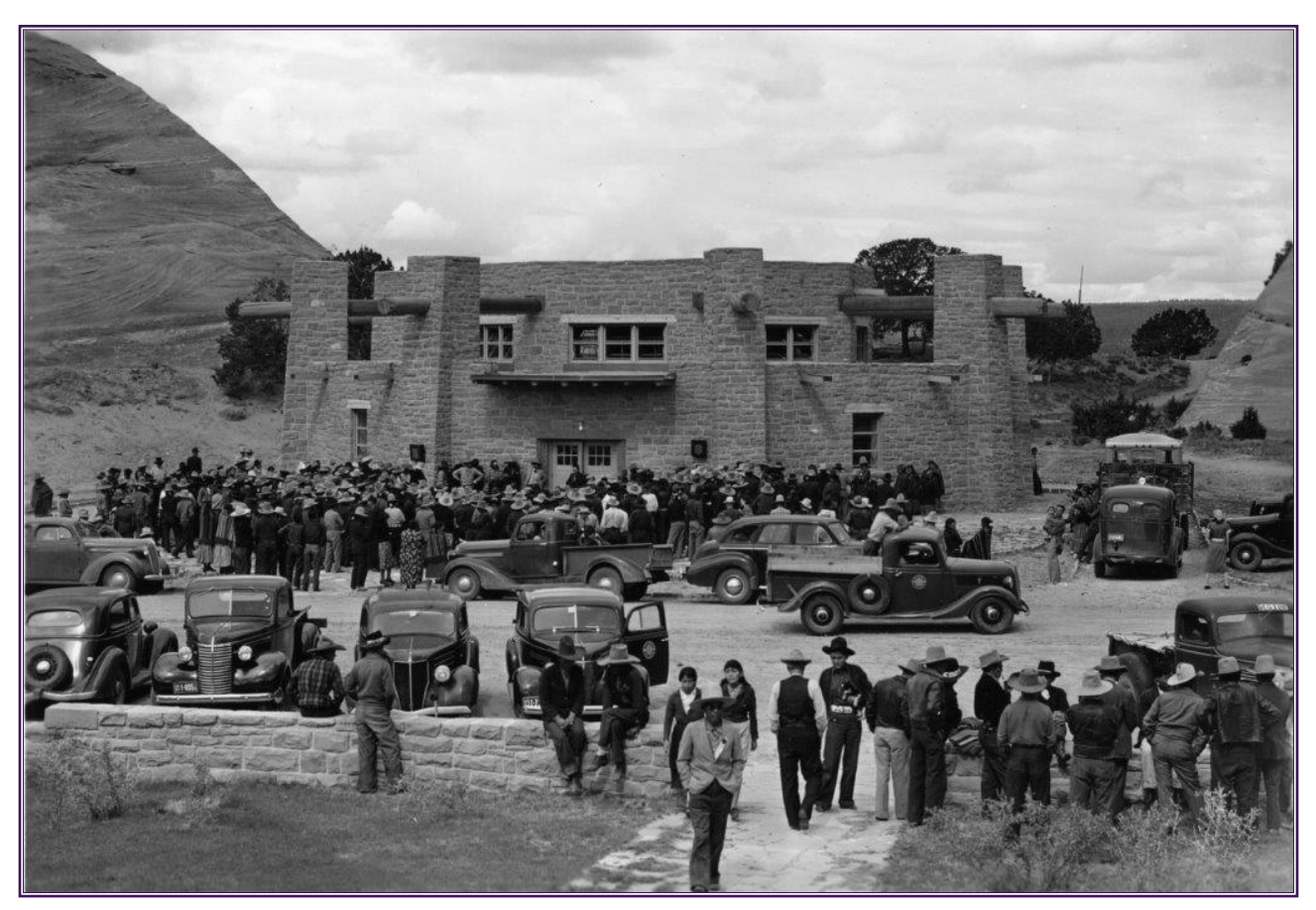
PHOTO: Photographed by Milton Samuel "Jack" Snow, c. 1945. Courtesy of the Navajo Nation Museum in Window Rock, Arizona.