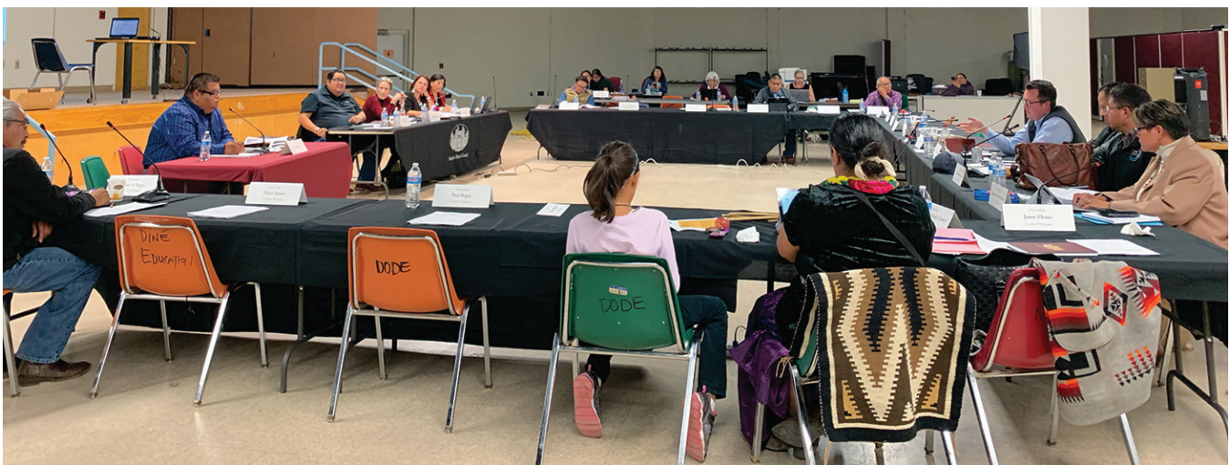
Last week, the 24th Navajo Nation Council hosted two work sessions regarding the Cloud Peaks Energy mine purchase by Navajo Transitional Energy Company.

During the discussions for the work session, it was