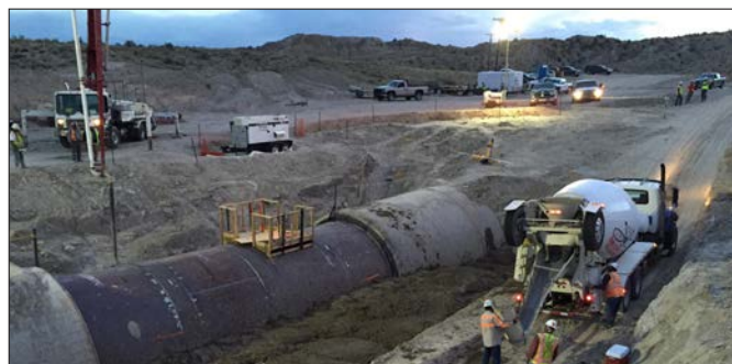
Photo: Workers worked in 24-hour shifts to repair the siphon breach, and was completed on June 10.

The responsibility for O&M for the NIIP infrastructure rests with the Bureau of Indian Affairs. NAPI has a contract with BIA to provide O&M, including replacement services on the NIIP water delivery systems. However, the funding does not include emergency services, which is necessary to operate the NIIP infrastructure due to recent events of the siphon breach.