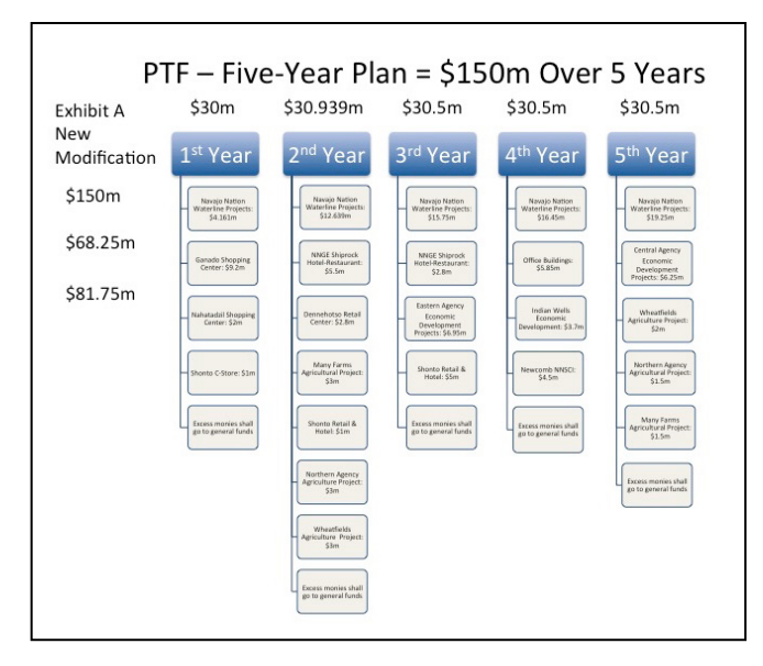
PHOTO (above): Chart of the proposed Navajo Nation Permanent Fund Income Five-Year Expenditure Plan that was approved on April 19, 2016.

"Going forward, this plan is going to promote