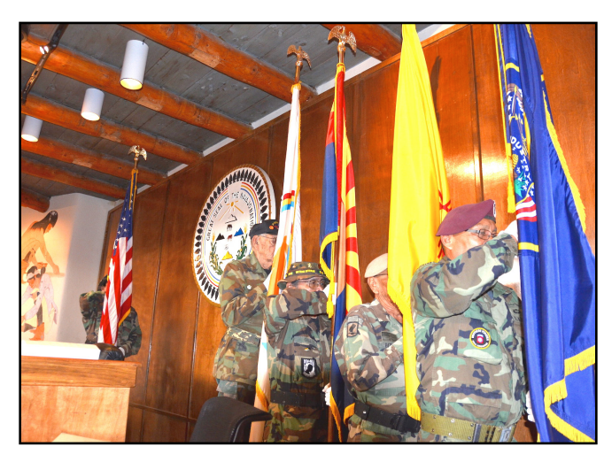
PHOTO (above): Chinle Agency Veterans Organization post colors on the opening day of the 2016 Spring Council Session.

Speaker Bates also thanked the second grade class from Wide Ruins Elementary School for singing the National Anthem and reciting the Pledge of Allegiance in the Navajo language, and the Chinle Veterans Organization for posting the colors at the start of the Spring Session.