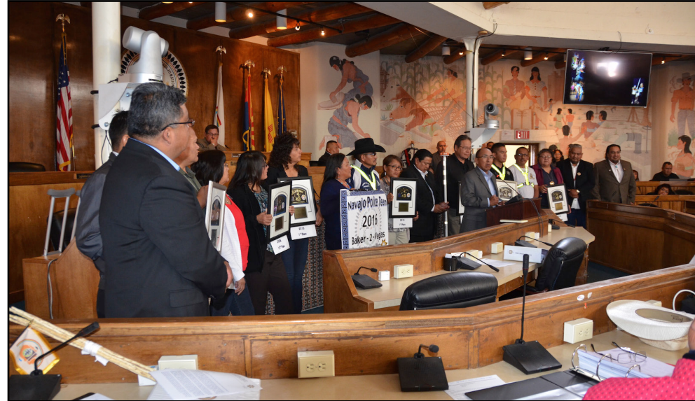
Photo (above): During the opening day of the 2016 Spring Council Session, the 23rd Navajo Nation Council recognized Team Navajo DPS, who are ranked fifth out of 264 domestic and internatinal teams for completing the Baker-to-Vegas Law Enforcement Challenge Cup Relay. Team Navajo DPS has participated in the race for the last 14 years.