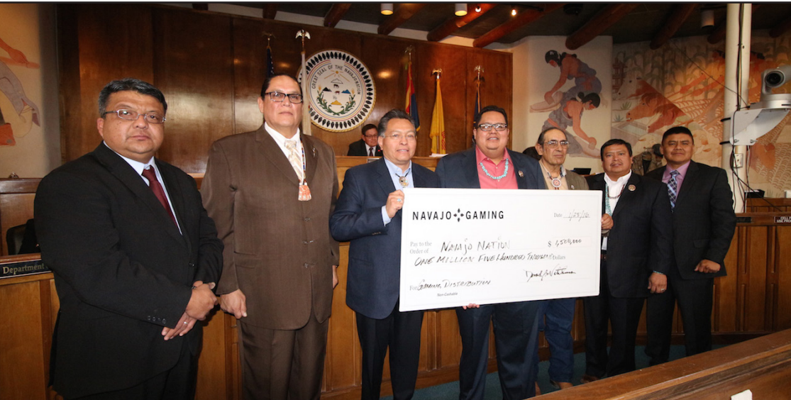
Photo (above): The Navajo Nation Gaming Enterprise presented a check in the amount of $1.5 million that will be distributed to all 110 Navajo chapters. The funds are a part of the Gaming Revenue Distribution Plan. The chairs of Council's standing committees accepted the check on behalf of the chapters.